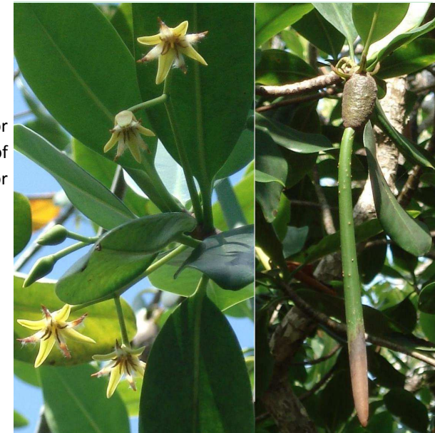
Red Mangrove flowers (left) and propagules (right)