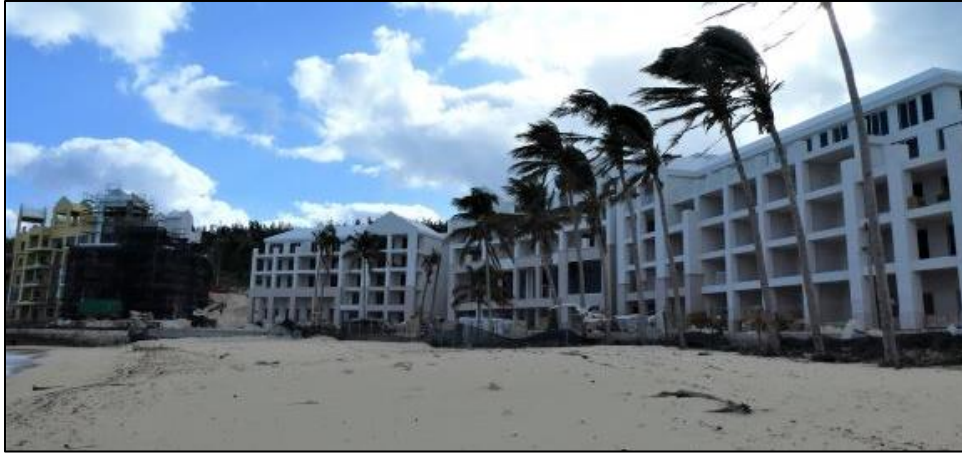
The St. Regis hotel under construction