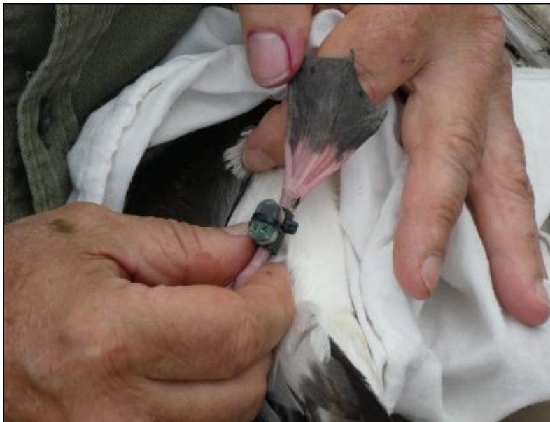
GPS tracker on the leg of an adult Cahow (Alison Copeland)

In collaboration with researchers in Europe, the DENR continued work to place GPS trackers on nesting Cahows in February. The devices will reveal where adult birds are foraging at sea. [A3.4, K migratory, K3.1, K2.2 sites, K4.2 habitat resto plan, J1.3 implement plan].