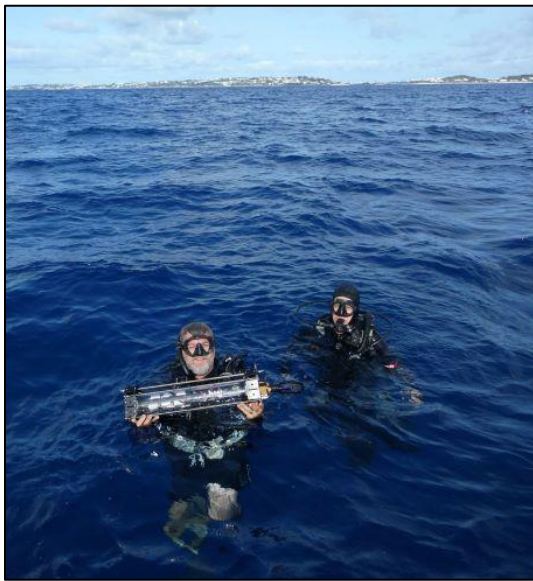
Divers placing the hydrophone

In February 2021 Bermuda joined the Caribbean Marine Mammals Passive Observatory Project with the deployment of a hydrophone off South Shore. The hydrophone, one of a network of twenty throughout the region, was designed by the University of Toulon and purchased by the Department of Environment and Natural Resources to expand our knowledge of what whale and dolphin species can be heard in Bermuda's waters a various times of the year. An article about the project appeared in the autumn 2021 Envirotalk: https://conservation-services.squarespace.com/s/Envirotalk-853-Autumn-2021.pdf