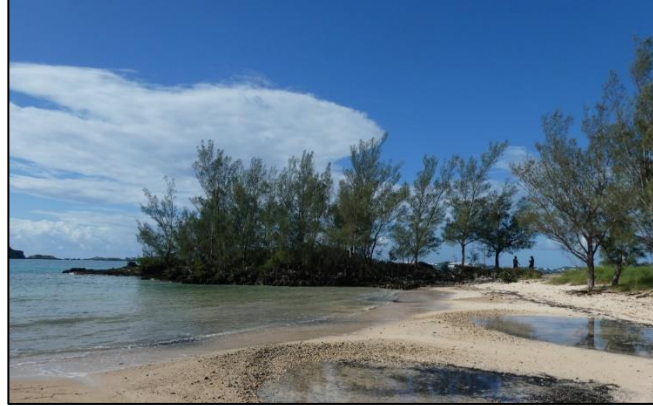
(L) HSBC volunteers with trash from Officer's Beach and (R) Goat Island before Casuarina removal

On October 27 th DENR's Jeremy Madeiros presented a virtual lecture for the BZS lecture series entitled 'Back from the brink, an update on the restoration of Bermuda's cahow.' [A2.4 lecture, K1.7 forum].