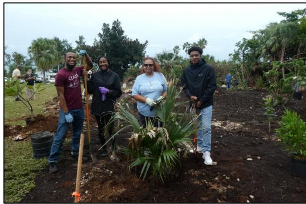
Trees awaiting planting, and Cedarbridge Academy students planting a palmetto

In early November staff from the Department of Environment and Natural Resources joined staff and volunteers from the Bermuda National Trust on Palm Island in Ely's Harbour to begin clearing invasive Casuarina trees from the island. Casuarina removal will free up space for planting of native plants, and will also improve the habitat for Longtails and Bermuda Skinks. [I3 PA mgt, E1.3 habitat restoration, E1.4 culling, A3.4 gov ngo collaboration].