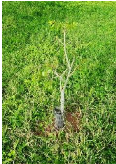
BBS indigenous plant flowerbed and planted Yellowwood (Alison Copeland)

In an article in the Royal Gazette on January 25 th farmer Roland Hill highlighted the dangers posed by scrambler bikes racing on the pathways in Hog Bay Park and the damage to his crops [I3, D3.6 infraction].