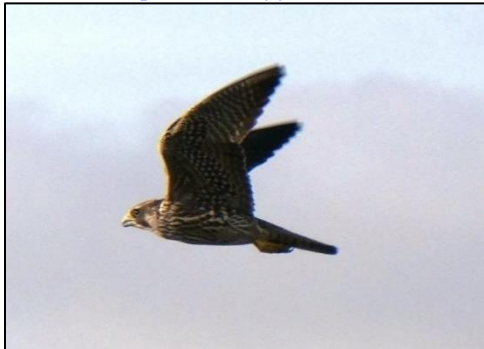
Peregrine Falcon over Cooper's Island on February 5 th

In early February sightings of one, possibly two, visiting Peregrine Falcons made news. [D2.2]. https://www.royalgazette.com/environment/news/article/20210208/rare-visiting-falcon-swoops-over-city/