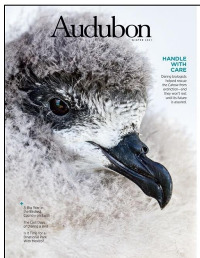
Magazine cover ( www.audubon.org )

On December 22 nd , the Winter 2021 edition of the US National Audubon magazine was published with a photograph of a Cahow taken by JP Rouja on the cover. The magazine contained an article on the Cahow recovery project entitled "It Takes a Helicopter Parent to Rescue a Rare Seabird from Extinction". [D2.1 int 1 , E3.5 photo]. https://www.audubon.org/magazine/winter-2021/it-takes-helicopter-parent-rescue-rare-seabird