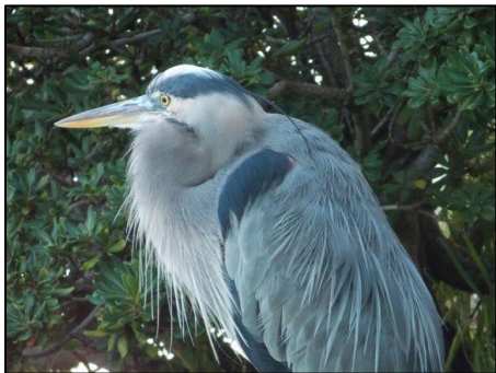
Great Blue Heron in Bermuda

A Great Blue Heron nicknamed Harper stopped over in Bermuda in October on her way from Canada to Cuba. The bird was fitted with a solar powered GPS tag in Maine in 2019. She flew non-stop for 40 hours from New Brunswick to Bermuda, spent three days in Bermuda, then flew for 30 hours to the Bahamas before continuing to Cuba. [K migratory, D2]. https://bernews.com/2021/11/harper-travels-for-40-hours-to-bermuda/