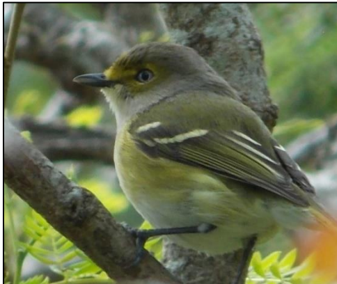
Vireo griseus bermudianus (Alison Copeland)

In September, the DENR published the first protected species management plan for the White-eyed Vireo or Chick-of-the-Village. The document is titled Management Plan for the Bermuda White-eyed Vireo ( Vireo griseus bermudianus ) . It was prepared by PhD candidate Miguel Mejias and contains new ecological data from his recently completed studies. [J1.6 new plan, J1.7 listed spp, J2.1 plan on web, K2 critical habitat, K3 species research, K4 spp. restoration].