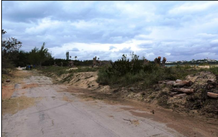
Chipping cut Casuarinas along the road at Long Bay, Cooper's Island (Alison Copeland)

https://environment.bm/news-hot-topics//casuarina-tree-removal-from-coopers-island-nature-reserve-1