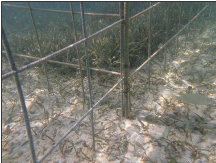
Seagrass protected by turtle exclusion cages at Trunk Island (Alison Copeland)

The Department of Planning initiated the next phase of the Energov file management system on January 15 th to allow customers to submit planning applications online, estimate fees, request inspections and search planning records. The first phase of the paperless submission system went live in August 2019. [H1 procedure review, H2].