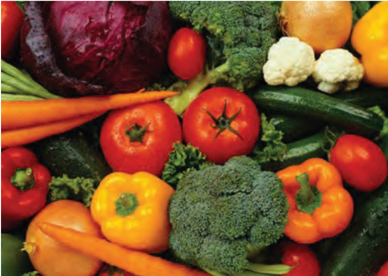
A few vegetables you can plant this winter

Beans, Beets, Broccoli, Cabbage, Carrots, Cassava, Cauliflower, Celery, Chard, Christophine, Corn, Cucumber, Kale, Leeks, Lettuce, Mustard Greens, Potatoes, Pumpkin, Radish, Rutabaga, Spinach, Squash, Sweet Potato, Tomato, Turnip.