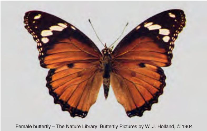
Female butterfly – The Nature Library: Butterfly Pictures by W. J. Holland, © 1904

In October of this year Bermuda was treated to an unexpected visit by a group of butterflies, Hypolimnas missipus . This butterfly known in different areas by many common names including the mimic, the diadem, the tropical blue moon butterfly, the egg fly, the tropic queen and the danaid butterfly. The 'blue moon' name is a reference to the blue halo on the wings of the male. The 'egg' name is a reference to the resemblance to a closely related Asian species ( H. antilope ) whose female sits over her batch of eggs until they hatch. This behavior may be protecting the eggs from parasitoid wasps that can attack the eggs.