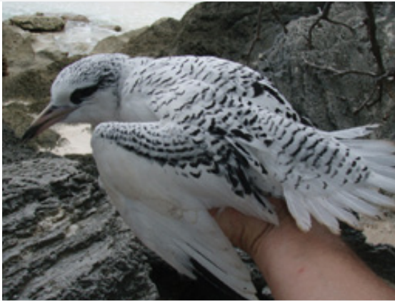
Nearly full fledged Tropicbird chick – J. Maderios

This study has confirmed that numbers of active, accessible longtail nests at the study locations increased from 159 in 2009, to 174 in 2010, and to 214 in the 2011 nesting season (See Table 1). The number of confirmed successfully fledged chicks likewise rose from 101 in 2009, to 132 in 2010, and to