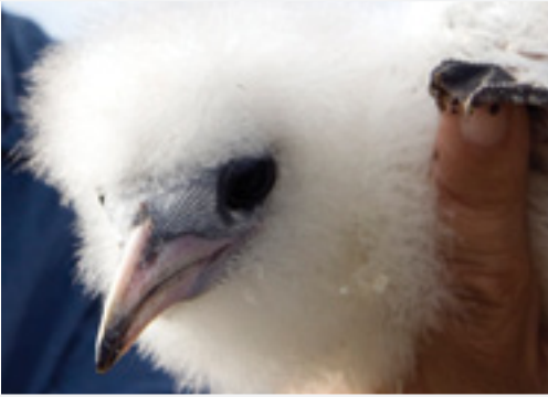
Check of downy Tropicbird chick

The Bermuda longtail, or white-tailed tropicbird as it is correctly known, is one of Bermuda's best-known and most loved bird species. Long considered to be the harbinger of spring, the first sighting of a longtail is an event that is always recorded in the local newspapers. The North Atlantic contains a distinct sub-species, nesting in Bermuda and the Caribbean.